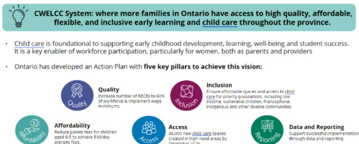
Figure 1: Ontario's Access and Inclusion Framework 2023 - CWELCC, June 2023

Ontario's Access and Inclusion Framework 2023 - CWELCC (June 2023), identifies the province's goals for access and inclusion under the CWELCC Agreement ( Figure 1 ), which are further elaborated on below: